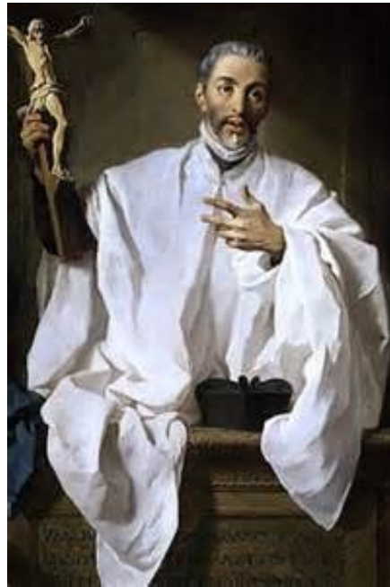
ST. BERNADINE OF SIENA