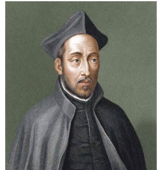
ST. IGNATIUS OF LOYOLA