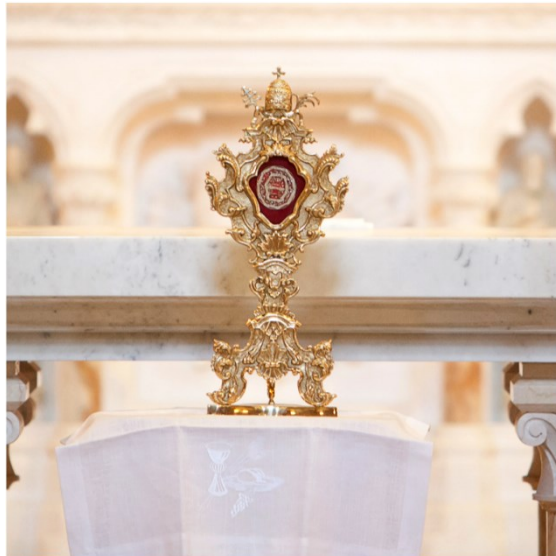
OUR MAIN RELIQUARY HOLDING THE RELICS OF POPE ST. PIUS X, ST. IGNATIUS OF LOYOLA AND ST. BERNADINE OF SIENA PRIOR TO HOLY NAME'S REDEDICATION ON MAY 18 TH , 2014.