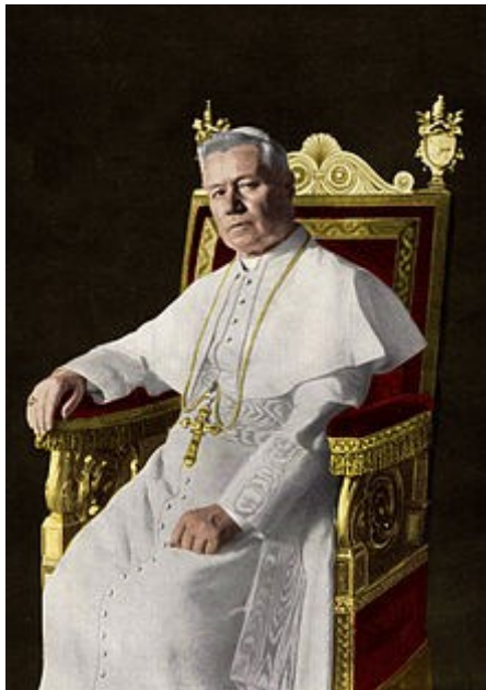
POPE ST. PIUS X